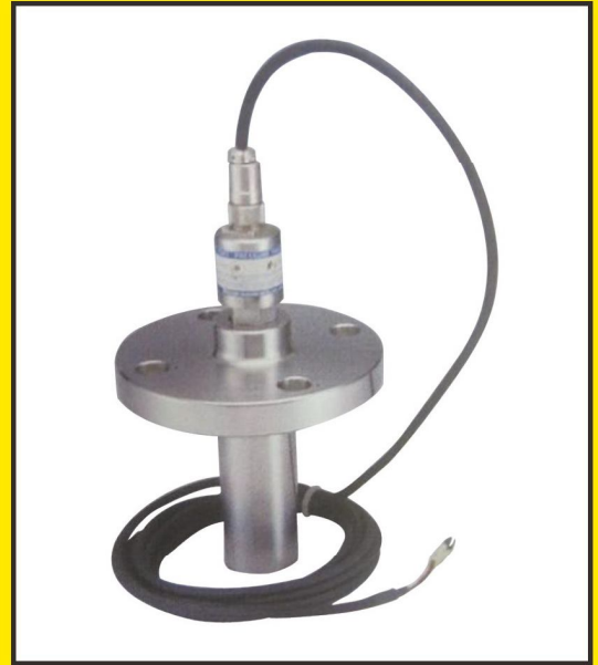
JF 300 JUMBO SINGLE FLANGE