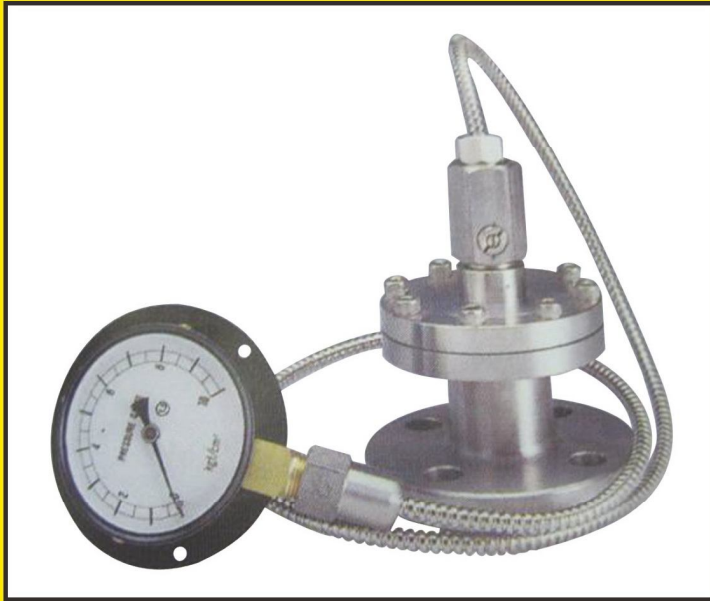
JF 200 DOUBLE FLANGE